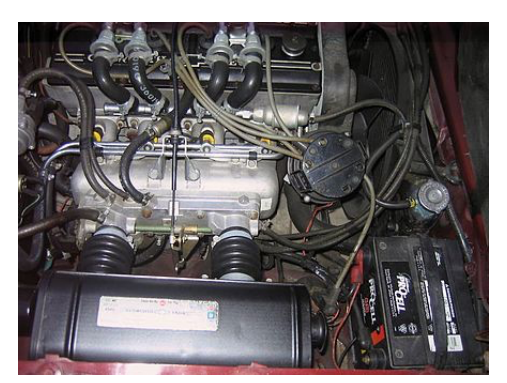
Chevrolet Cosworth Vega engine showing Bendix electronic fuel injection (in orange).

In Japan, the <u>Toyota Celica</u> used electronic, multi-port fuel injection in the optional <u>18R-E</u> engine in January 1974. <sup>[26]</sup> Nissan offered electronic, multi-port fuel injection in 1975 with the Bosch L-Jetronic system used in the <u>Nissan L28E</u> engine and installed in the <u>Nissan Fairlady Z</u>, <u>Nissan Cedric</u>, and the <u>Nissan Gloria</u>. Nissan also installed multi-point fuel injection in the <u>Nissan Y44</u> V8 engine in the <u>Nissan President</u>. Toyota soon followed with the same technology in 1978 on the <u>4M-E</u> engine installed in the <u>Toyota Crown</u>, the <u>Toyota Supra</u>, and the <u>Toyota Mark II</u>. In the 1980s, the <u>Isuzu Piazza</u> and the <u>Mitsubishi Starion</u> added fuel injection as standard equipment, developed separately with both companies history of diesel powered engines. 1981 saw Mazda offer fuel injection in the <u>Mazda Luce</u> with the <u>Mazda FE engine</u> and, in 1983, Subaru offered fuel injection in the Subaru EA81