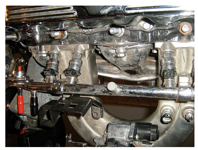
<u>Fuel rail</u> connected to the injectors that are mounted just above the intake manifold on a fourcylinder engine.

All compression-ignition (diesel) engines use fuel injection, and many <u>Spark-ignition engines</u> use fuel injection of one kind or another. In automobile engines, fuel injection was first volume-produced in the late 1960s, and gradually gained prevalence until it had largely replaced <u>carburetors</u> by the early 1990s.<sup>[1]</sup> The primary difference between carburetion and fuel injection is that fuel injection <u>atomizes</u> the fuel through a small nozzle under high pressure, while a carburetor relies on <u>suction</u> created by intake air accelerated through a <u>Venturi tube</u> to draw the fuel into the airstream.