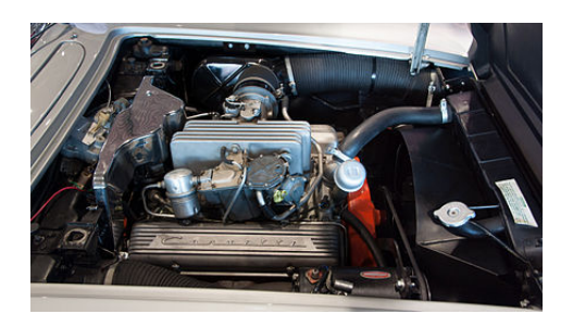
A 1959 <u>Corvette</u> small-block 4.6 litre V8 with Rochester mechanical fuel injection

<u>Chevrolet</u> introduced a mechanical fuel injection option, made by <u>General Motors' Rochester Products Division</u>, for its <u>283 V8</u> <u>engine</u> in 1956 (1957 U.S. <u>model year</u>). This system directed the inducted engine air across a "spoon shaped" plunger that moved in proportion to the air volume. The plunger connected to the fuel metering system that mechanically dispensed fuel to the cylinders via distribution tubes. This system was not a "pulse" or intermittent injection, but rather a constant flow system, metering fuel to all cylinders simultaneously from a central "spider" of injection lines. The fuel meter adjusted the amount of flow according to engine speed and load, and included a fuel reservoir, which was similar to a carburetor's float chamber. With